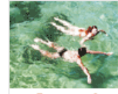
Romance & Relaxation