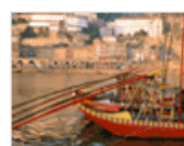
Porto e Norte Region