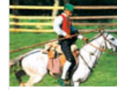
Packages & Deals