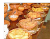
Food & Wine